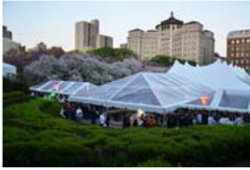
The Crystal Party for Mount Sinai Medical Center took place in the Conservatory Garden of Central Park; the tent was used the day before for Central Park Conservancy's hat luncheon.